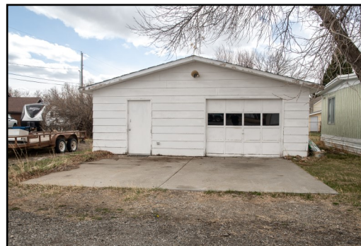
419 E. 8th Ave. Big Timber, Montana